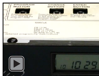
Setting Time Video (click)