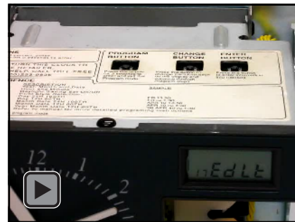
DST End Date Video (click)